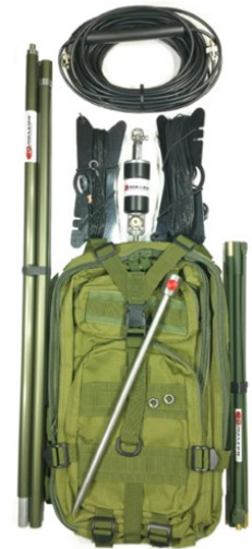
Chameleon MPAS 2.0 Antenna Kit (below)

Most folks rely on transceivers that have more of a mobile style - Yaesu FT-891, IC-7100, Yaesu FT-857, and others - the lighter the better, especially if you are hiking to your operating spot. Honestly, you can operate portably with the IC-7300, but requires a little forethought before operating. Most POTA operators use a radio, a battery, the occasional tuner, and a good portable antenna. I personally use the IC-7100 (I received for Christmas) with headset (Heil Proset IC), a Bioenna 20ah Lithium Iron Phosphate Battery, the LDG IT100 Tuner, coax, and a small assorted of portable antennas with a 40' Spiderbeam.